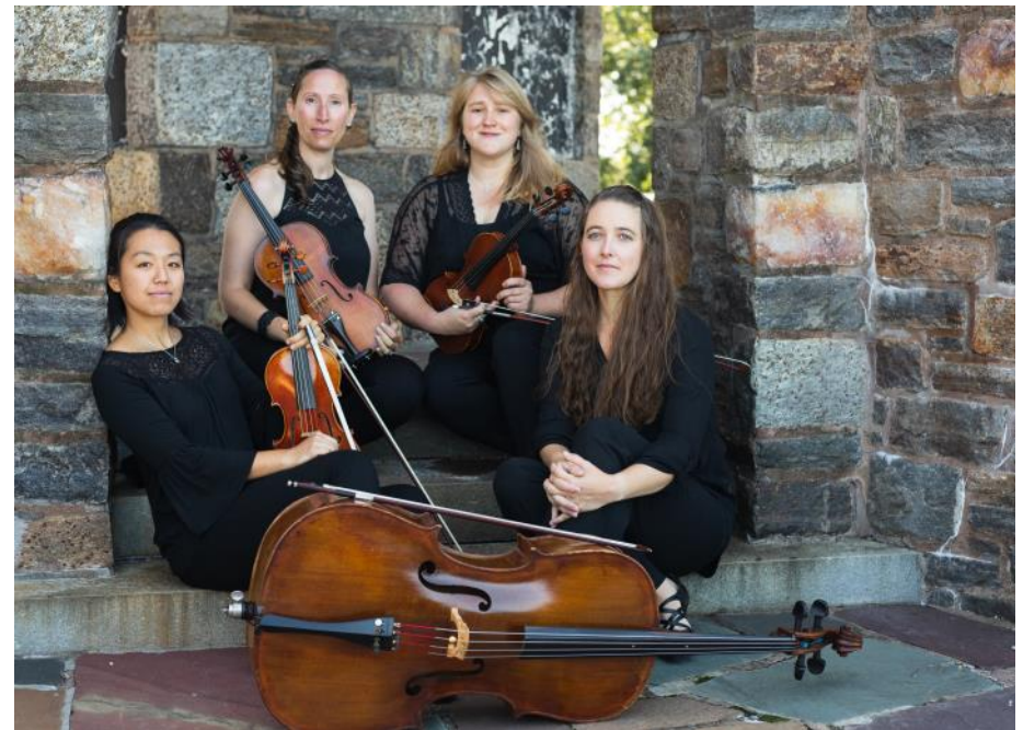
Andante String Quartet

For other days when the house is open for tours, please see: leroyandersonfoundation.org/house-museum.php