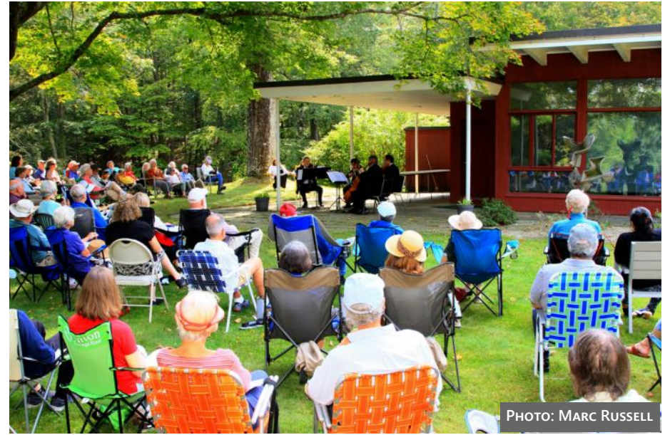
Deming String Quartet

All Concert Programs will be posted to our website: leroyandersonfoundation.org/concerts.php