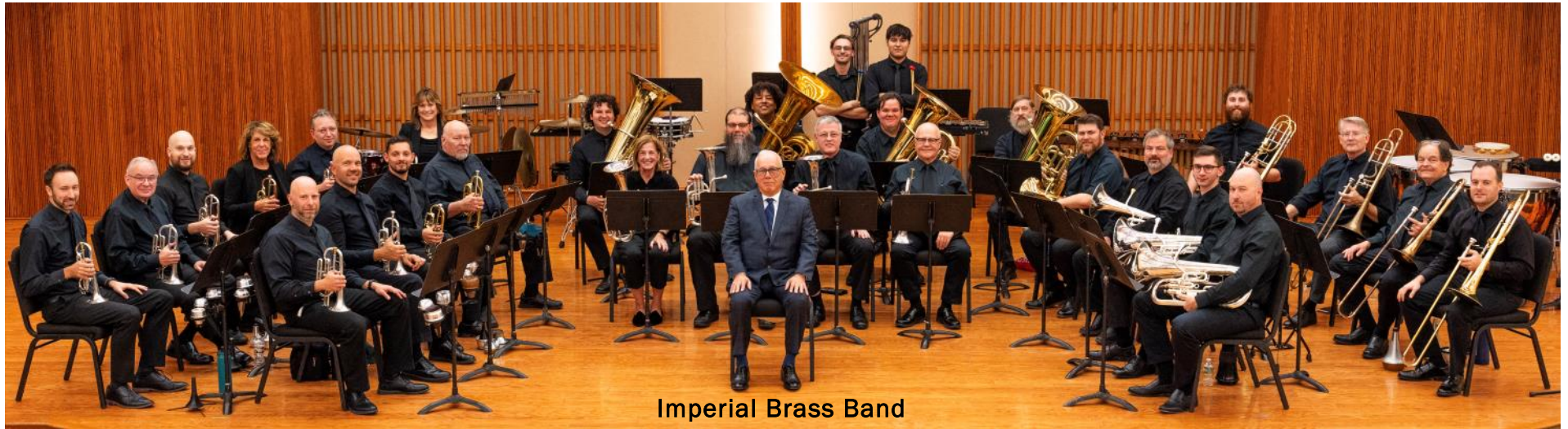
Imperial Brass Band