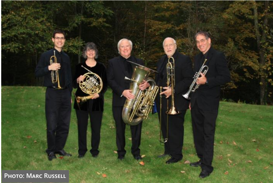
Premier Brass Quintet