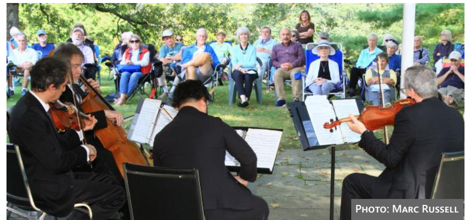
Deming String Quartet

Bring a folding chair for outdoor concerts